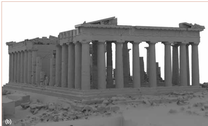
Figure 7. Capturing the lighting and geometry of the Parthenon. (a) A light probe device records incident lighting conditions near the base of the temple. (b) A 3D surface model of the scene geometry obtained using 3D laser scanning.