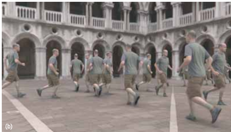
Figure 6. The Light Stage 6 performance relighting system. (a) A running subject is recorded in Light Stage 6, an 8-meter sphere that captures dynamic subjects under a wide array of viewing and lighting directions. (b) Several instances of the runner are rendered into a photographed environment, each with its viewpoint and illumination chosen to be consistent with the virtual scene.