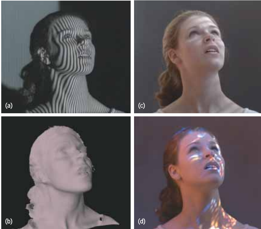
Figure 5. Simulating spatially varying illumination on an actor's performance. (a) The actor is lit by a structured illumination pattern from a high-speed video projector. (b) A geometric model is derived for a frame of the performance. (c) The actor is virtually illuminated as if in a room with sunlight streaming through Venetian blinds. (d) The actor is virtually illuminated as if in a cathedral with light projected from a stained glass window.

ing variation across (x_b, y_b, z_b) , returning us to the impractical situation of needing to capture the effect of incident illumination one ray of light at a time.