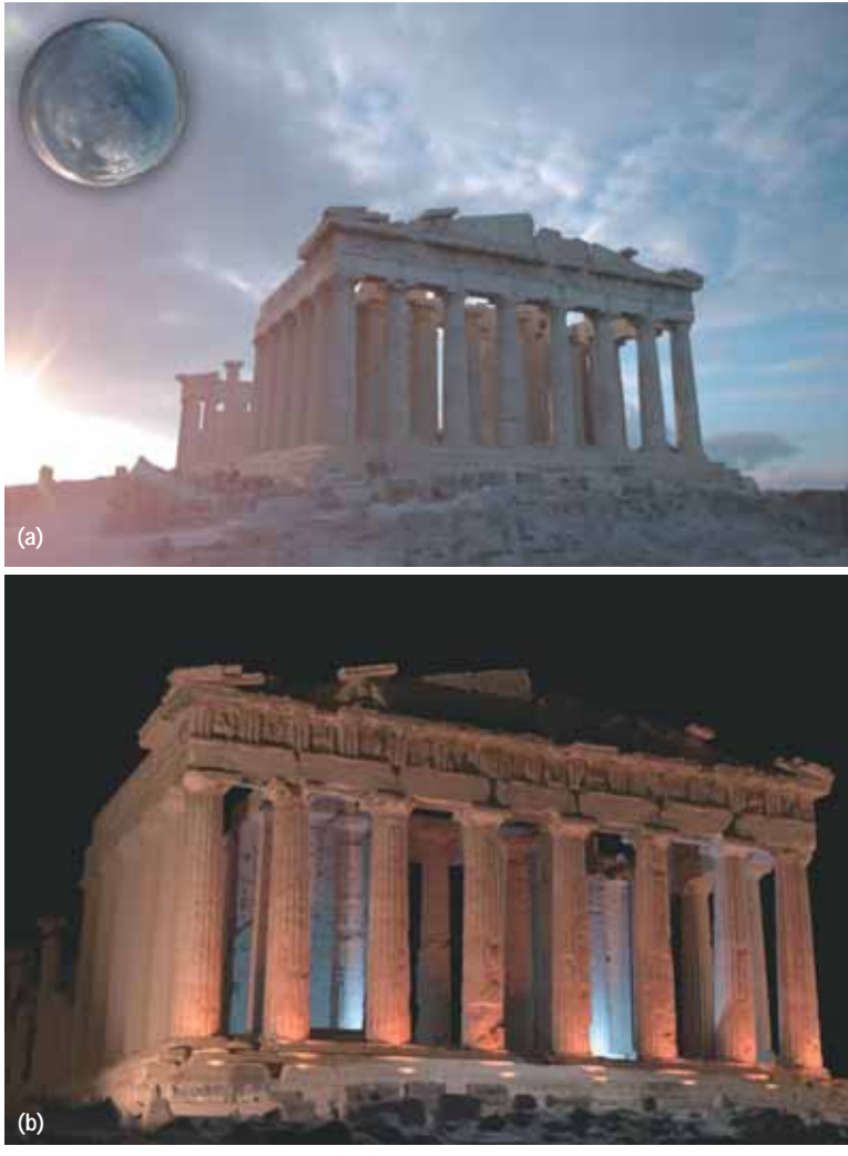
Figure 8. The Parthenon virtually reilluminated. (a) A virtual model of the Parthenon rendered as it would appear under natural illumination (inset) recorded in Marina del Rey, California. (b) The relightable model rendered with a nighttime lighting design.

aries (that is, at the scanned 3D geometry) and that the surface reflectance effects were well-characterized by relatively diffuse (rather than shiny) materials. Nonetheless, the model realistically depicts the Parthenon as it would appear under essentially any new lighting conditions.