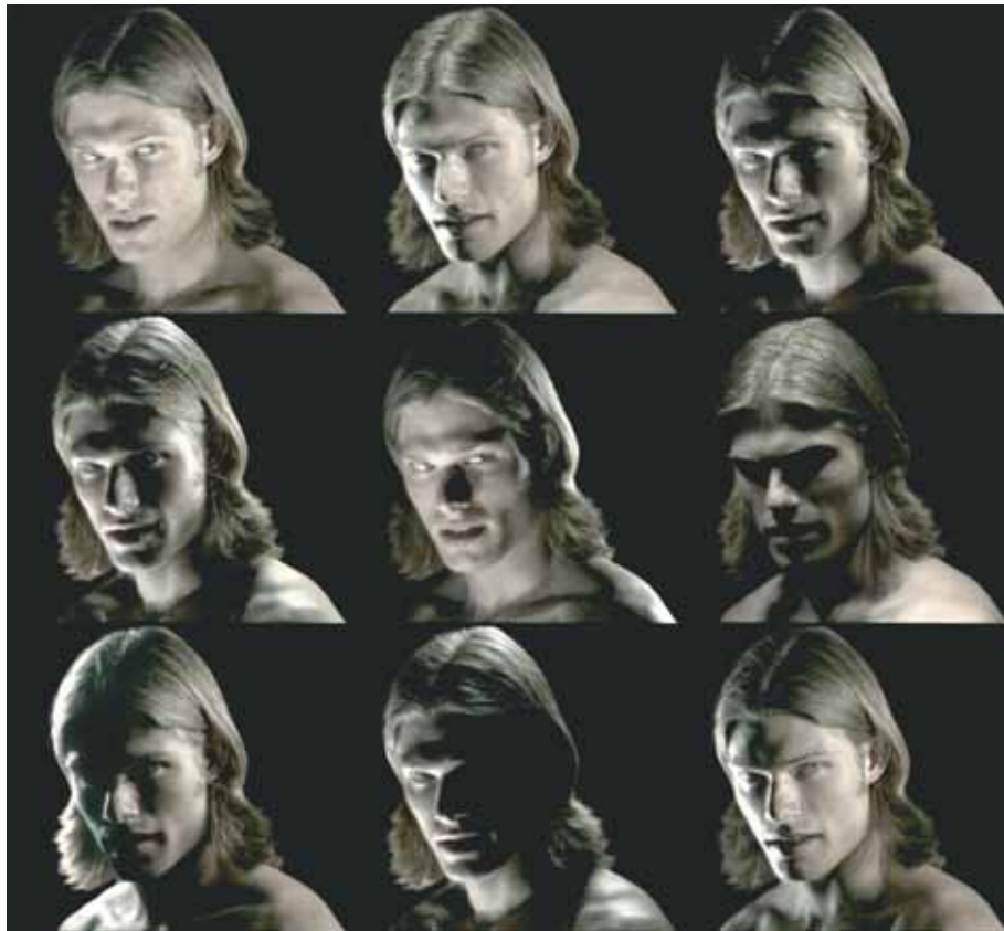
Figure 4. A frame from a performance by actor Chris Carmack, directed by Randal Kleiser, virtually rendered with nine different lighting configurations.

From this data, we can show how the actor's performance would appear under any number of lighting conditions by summing scaled and tinted versions of the