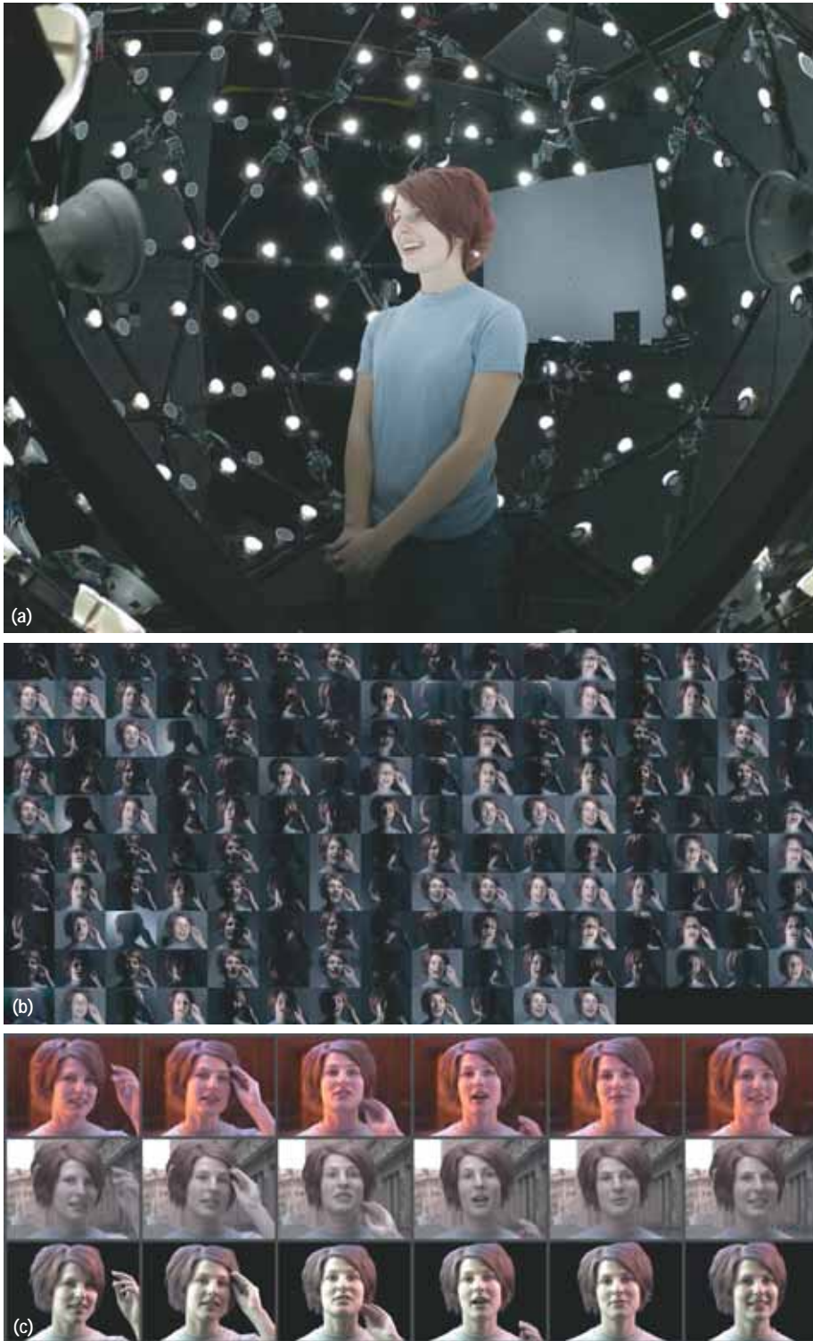
Figure 3. The Light Stage 5 performance relighting process. (a) A sphere of 156 white LED light sources surrounds the actor as a microcontroller changes the lighting direction several thousand times per second. A high-speed digital video camera captures the actor's appearance under each lighting direction. (b) 156 consecutive high-speed frames of the actor's performance captured in just 1/24th of a second, each showing a different basis lighting direction. (c) The actor's performance synthetically illuminated by two real-world lighting environments (Grace Cathedral, top; the Uffizi Gallery, middle) and a synthetic lighting environment (below) formed as linear combinations of the basis lighting directions.

exhaustively even for a limited region of space is much more daunting than capturing just a single plenoptic function, and conjures images of robotic armatures moving lasers and sensors throughout a scene, recording terabytes upon terabytes of information.