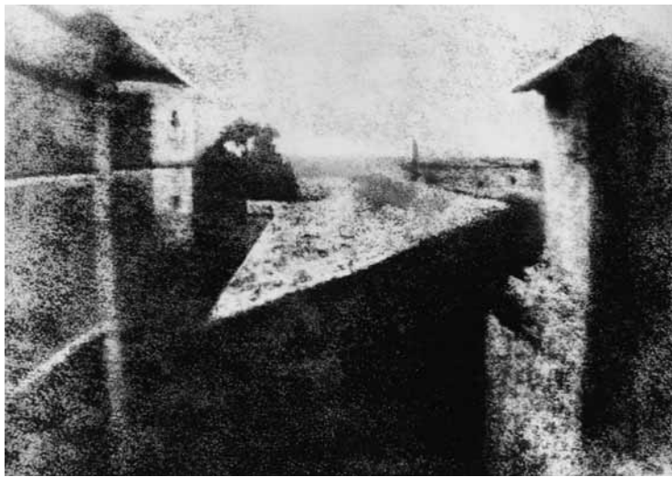
Figure 1. The first photograph, Joseph Nicéphore Niépce, 1826.

Most of the photographic imagery we view today—cinema and television—records and reproduces light across all of these dimensions, providing an even more compelling experience of scenes from other times and places.